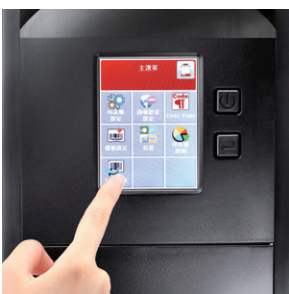
3.2" color LCD panel designed for ease of use

The RT860i is a perfect companion to deliver fine quality printing at a superb value.