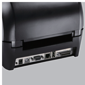
Ethernet, USB, Serial, and Parallel Ports Standard for easy integration