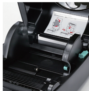
Drop-in label roll holder for easy media installation