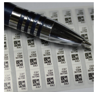
Micro print at 600 dpi resolution